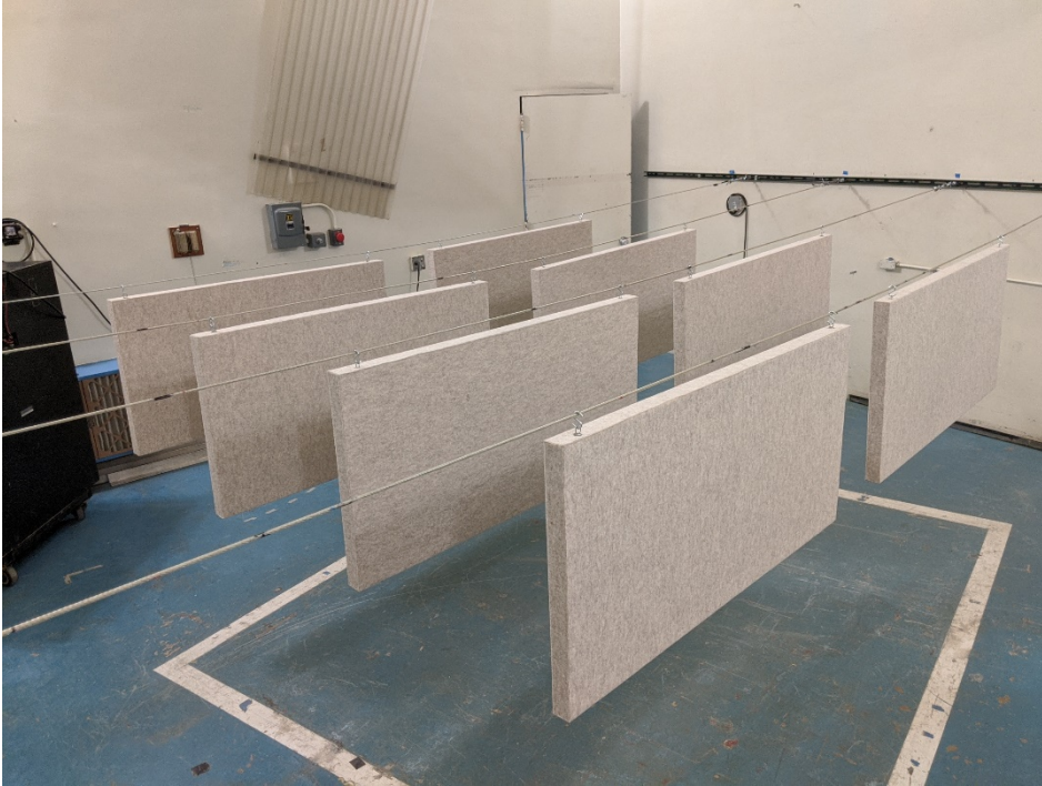
Figure 1 – Specimen mounted in test chamber