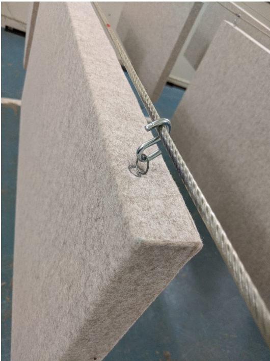
Figure 2 – Detail of specimen in test chamber