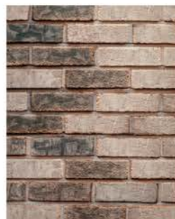
FabriSPAN® Printed Fabric